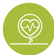
Healing Hearts at Home